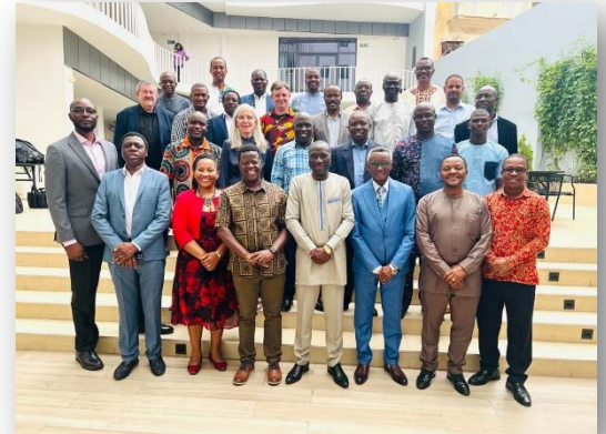
In Senegal with our African Regional leaders