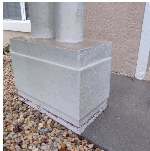
The dark line shown here is where the water came to on our front entrance way.

lost it, unlike 2 million others including our son David) and we still had water and sewer. Unlike our next-door neighbors, the water did not continue rising and come in our home but we still had a lot of clean up and vehicle repair.